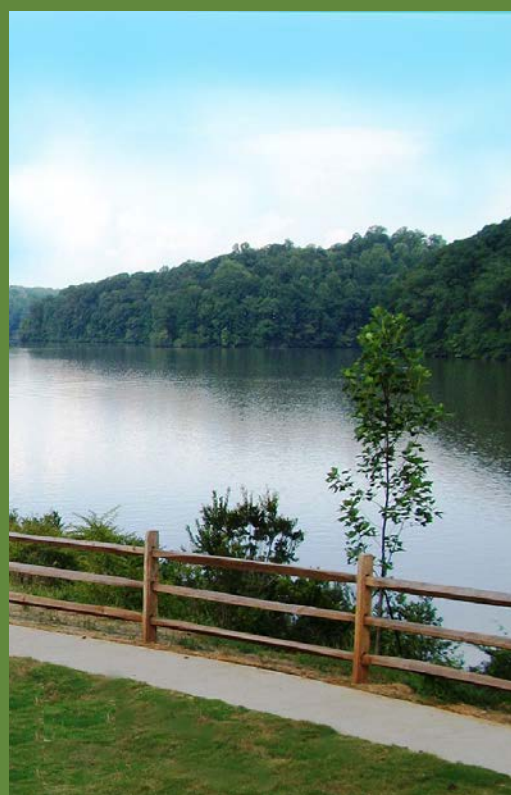
Chattahoochee River at Morgan Falls Overlook Park which provides a river access launch dock.