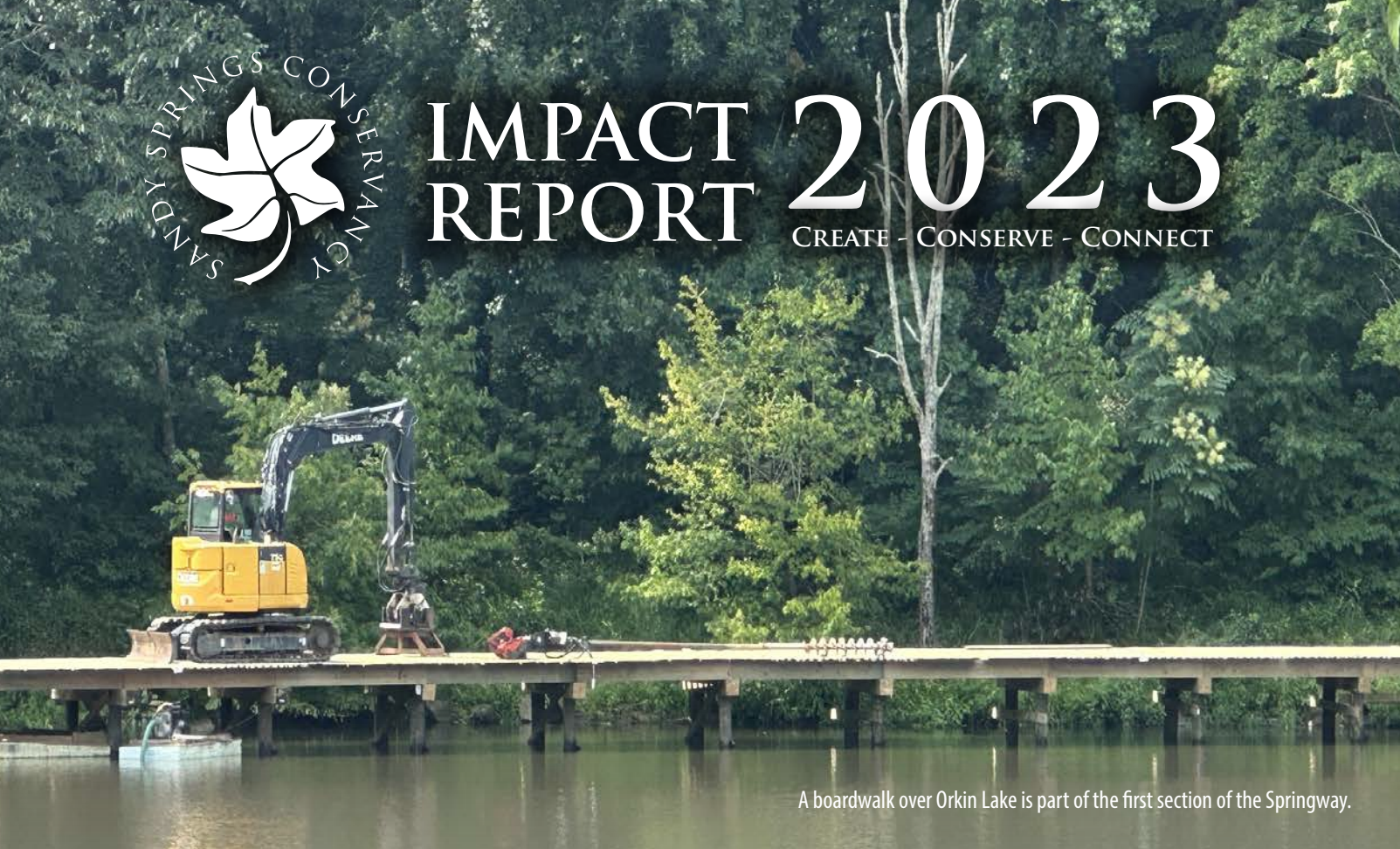
A boardwalk over Orkin Lake is part of the first section of the Springway.